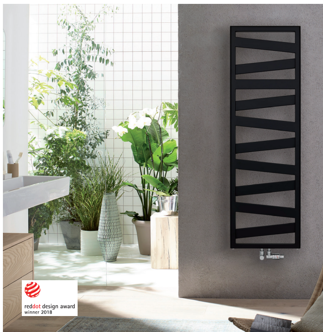
Radiator colour: Black Matt