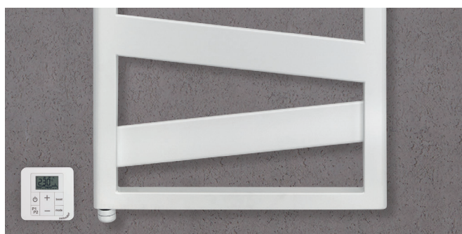
Radiator colour: Ruby Red, Traffic White

Zehnder Kazeane decorative radiator made from vertically arranged D-profile tubes rounded at the outside, 30 x 40 mm, plus offset and diagonally arranged flat tubes, 70 x 8 mm, which wrap around the bathroom radiator like a steel band. The resulting generous cut-outs on two levels create space for hanging several towels. Additionally, one or two horizontal flat tubes, depending on height. D-profile tubes arranged at the top and side, plus square tube, 30 x 30 mm, at bottom create a functional mounting plate.